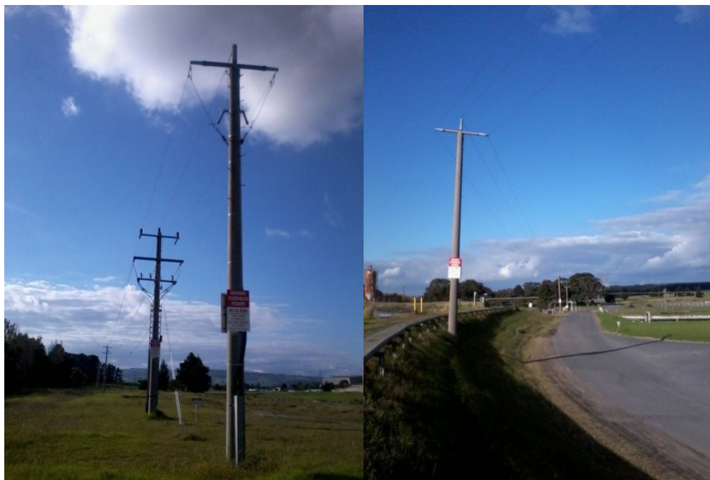
Pole 1: looking North