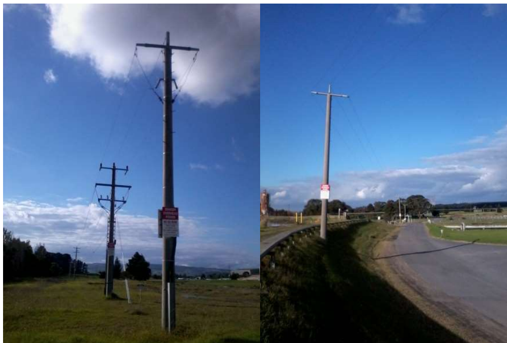
Pole 1: looking North